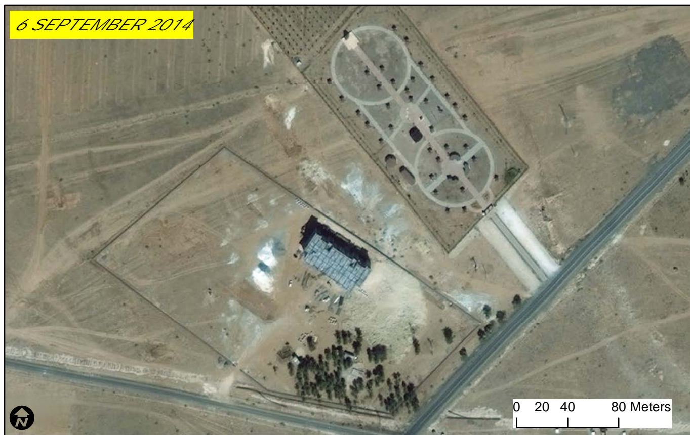
Figure 6: Newly constructed refugee settlement