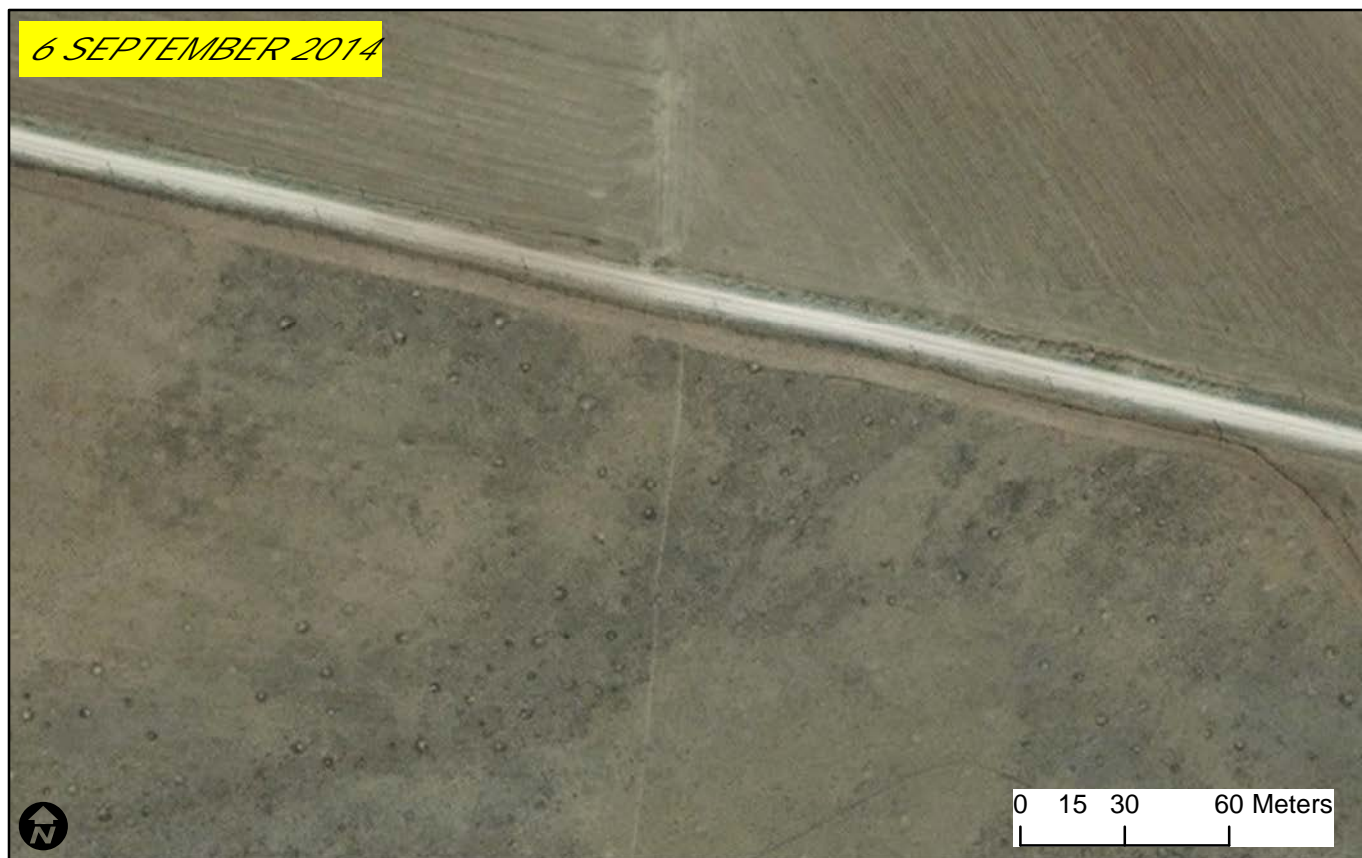
Figure 5: Vehicles at border crossing point