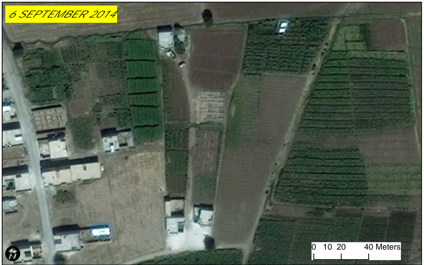
Figure 3: Munitions impact craters on fields