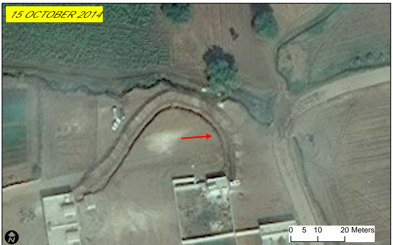
A fortified fighting position is visible inside of the town (red arrow) in the proximity of an access road with restricted access.