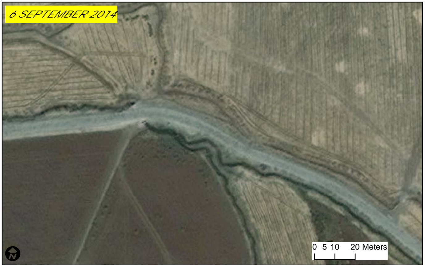
Figure 2: Roadblocks and fortified fighting line