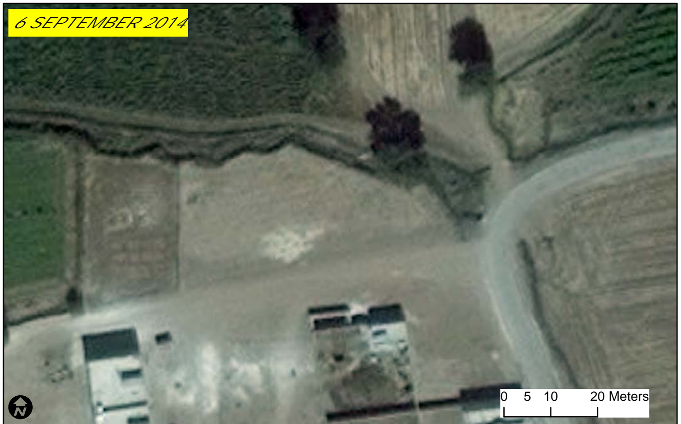
Figure 4: Fortified fighting position