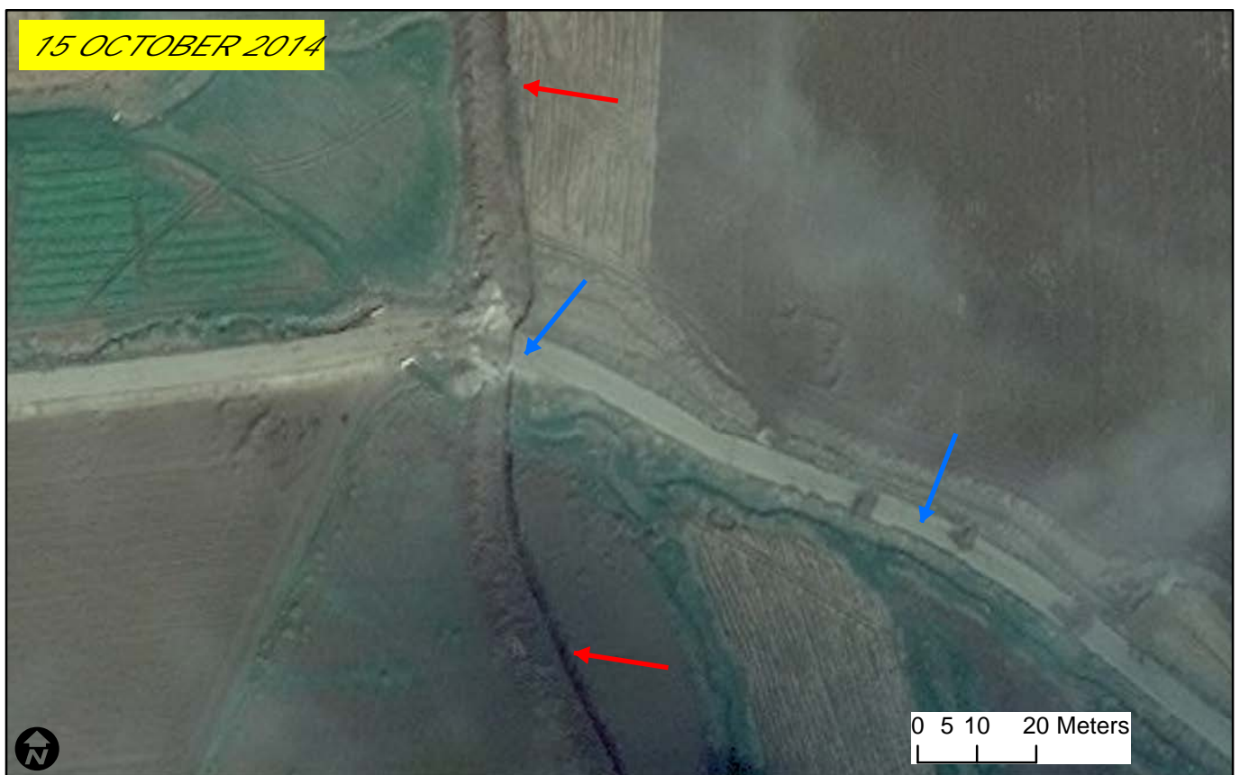
Imagery shows roadblocks and access control points placed along the roads preventing access to the town (blue arrows). A probable fortified fighting line is also visible in the imagery (red arrow).