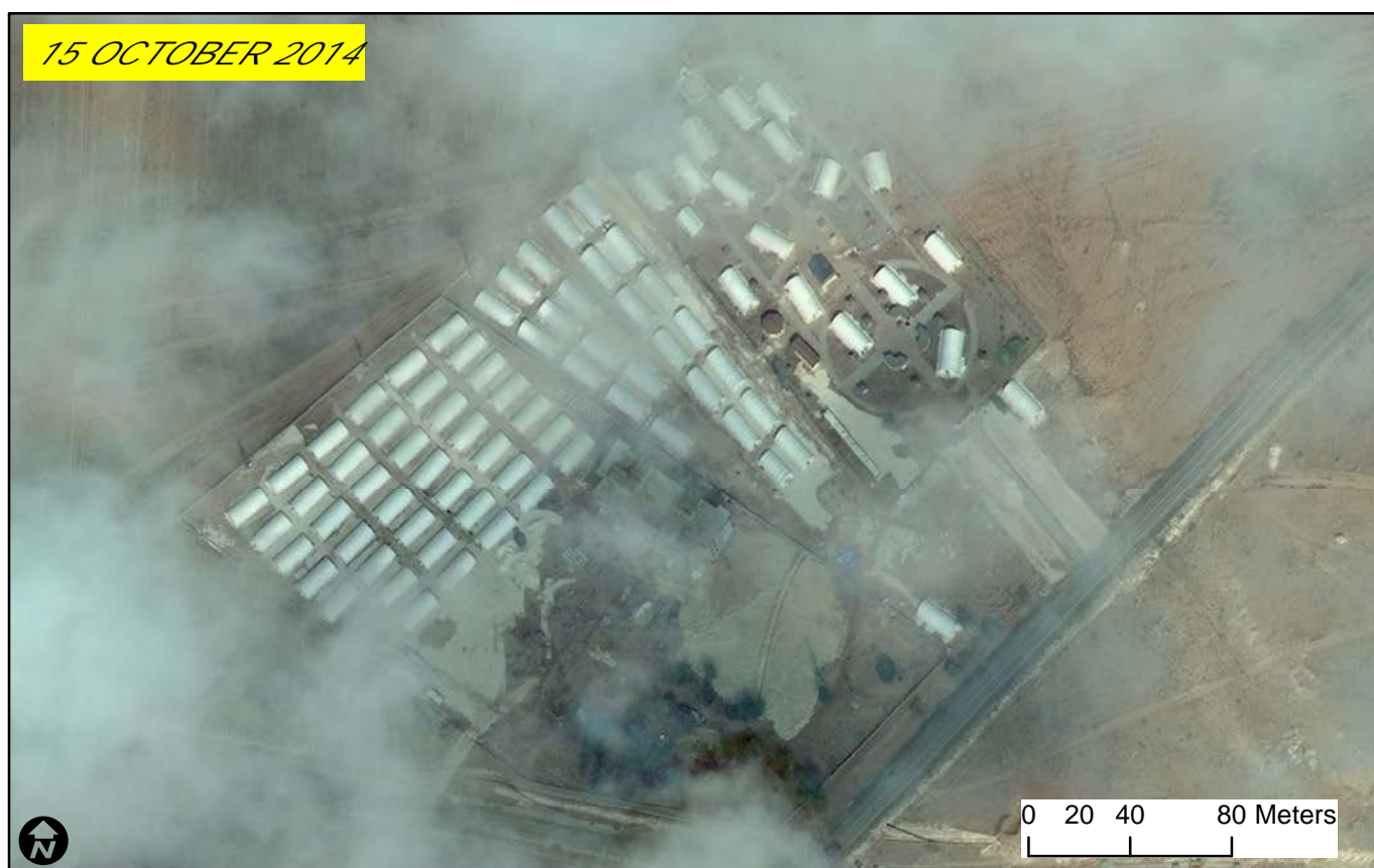
Close to the border, on the Turkish side a refugee camp has been created in order to accommodate increased number of refugees fleeing Kobani.