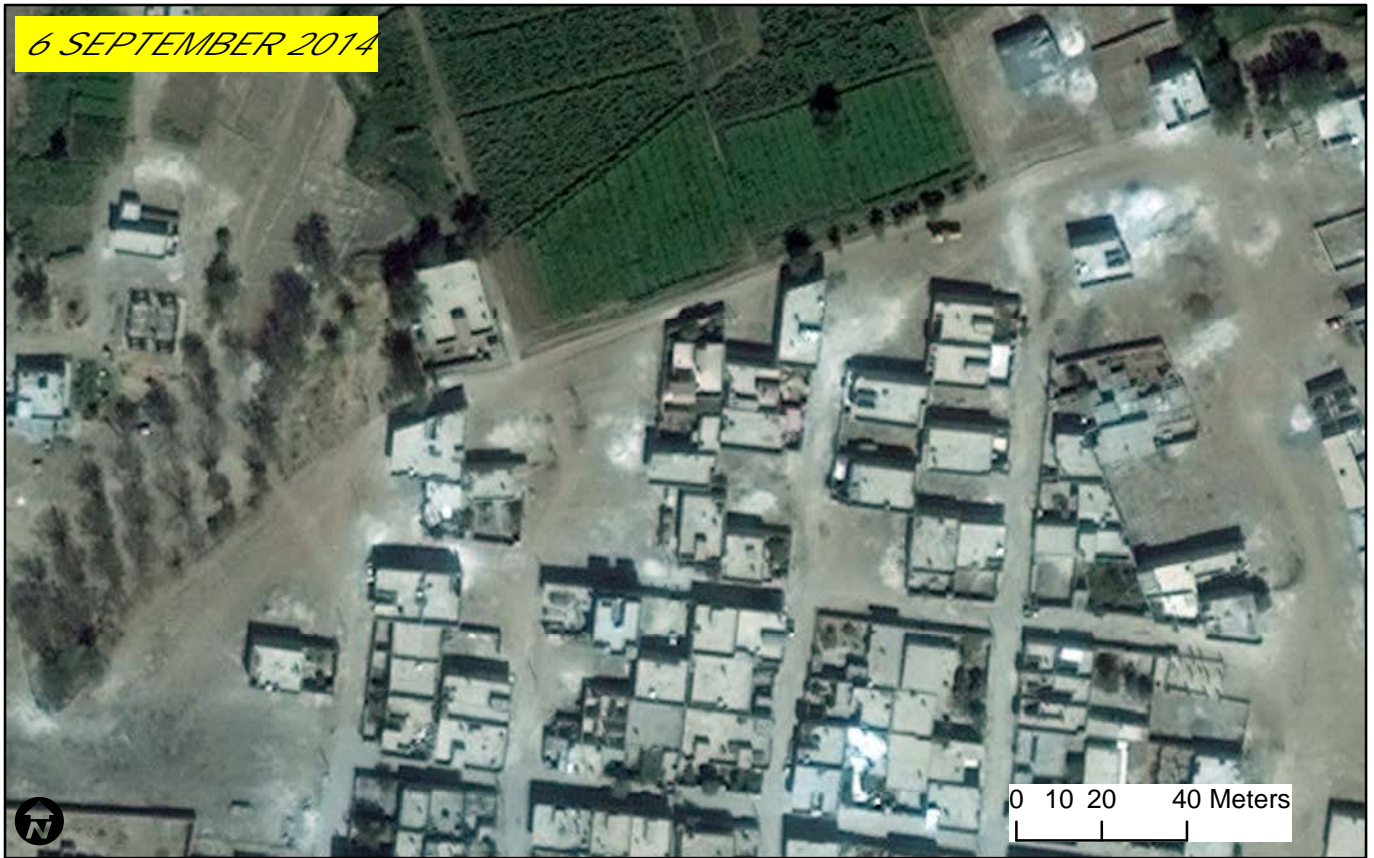
Figure 1: Destroyed and damaged structures in Kobani