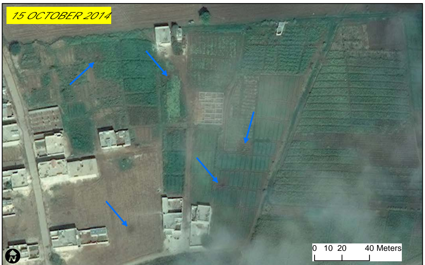
UNOSAT also detected numerous munitions impact craters on the fields (blue arrows) in and around Kobani.