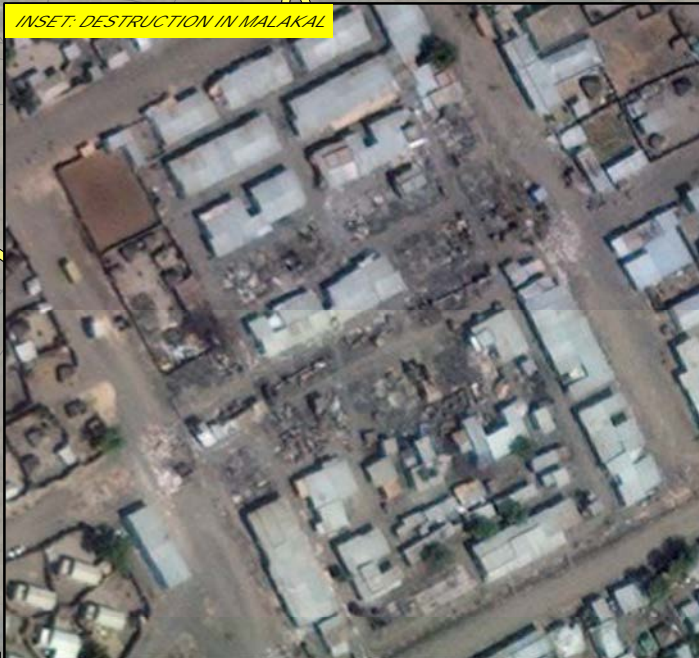
INSET: DESTRUCTION IN MALAKAL

See inset for close-up view of destruction